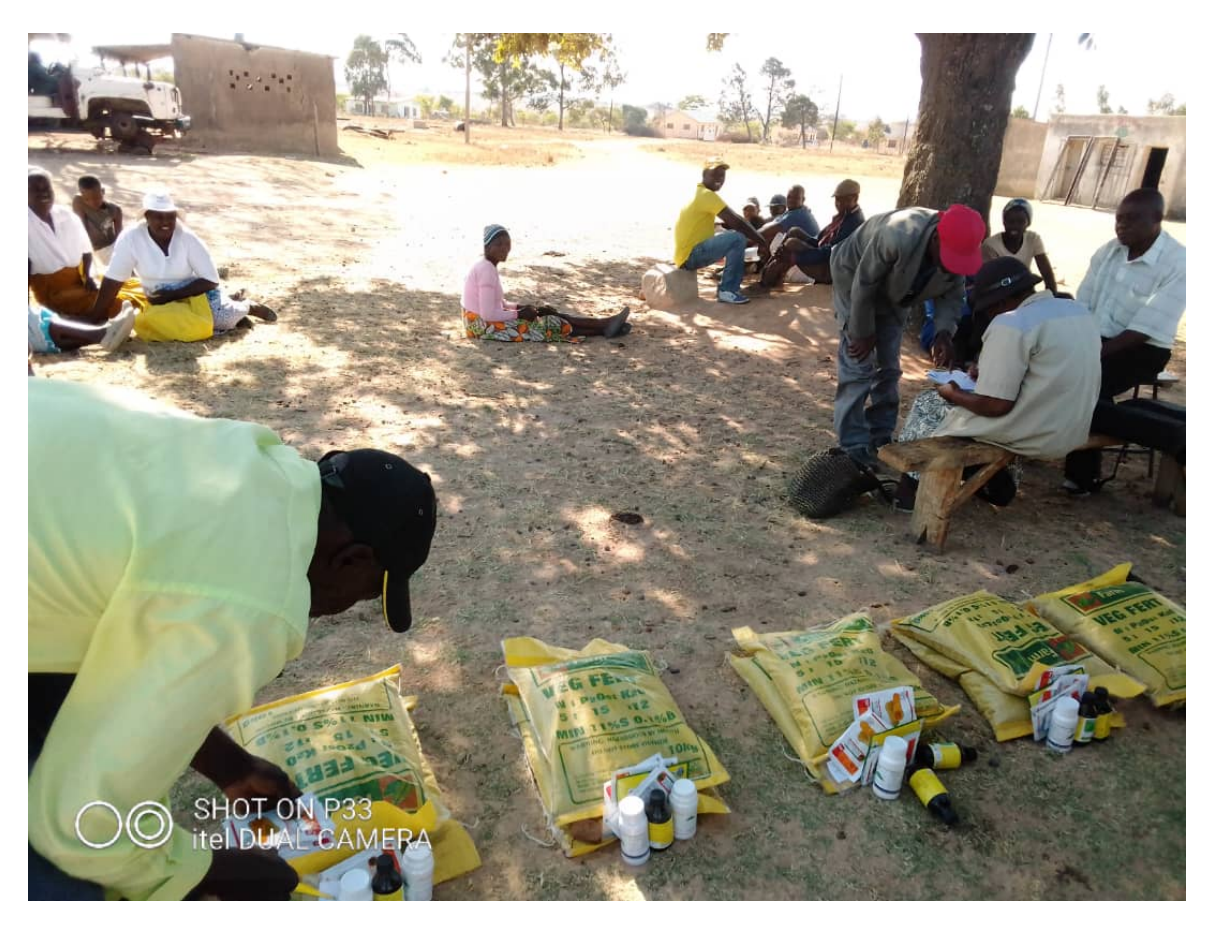
Ward 19 distribution of livelihoods inputs for gardens. Councillor, Agritex supervisor and extension officer issuing out the garden inputs.