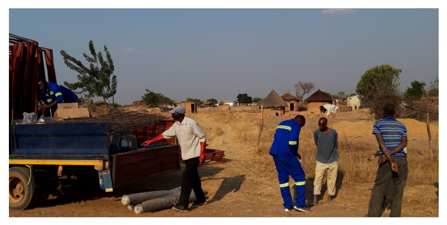
Distribution of building materials to beneficiaries of the shelter component who are ready to start construction with all locally found materials mobilised. On picture distribution was taking place in ward 17, Rufu village.