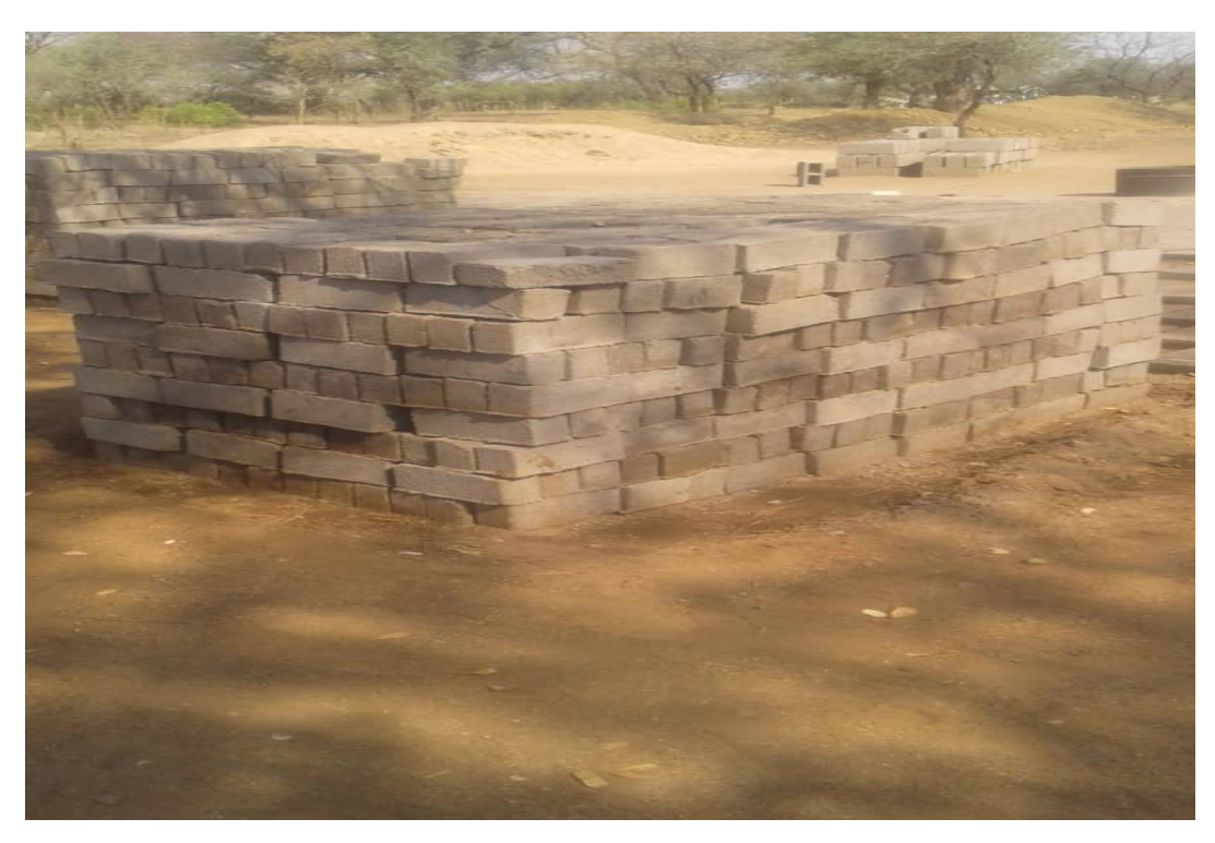
Construction material in place at Mwanyisa primary ward 24 Chipinge district