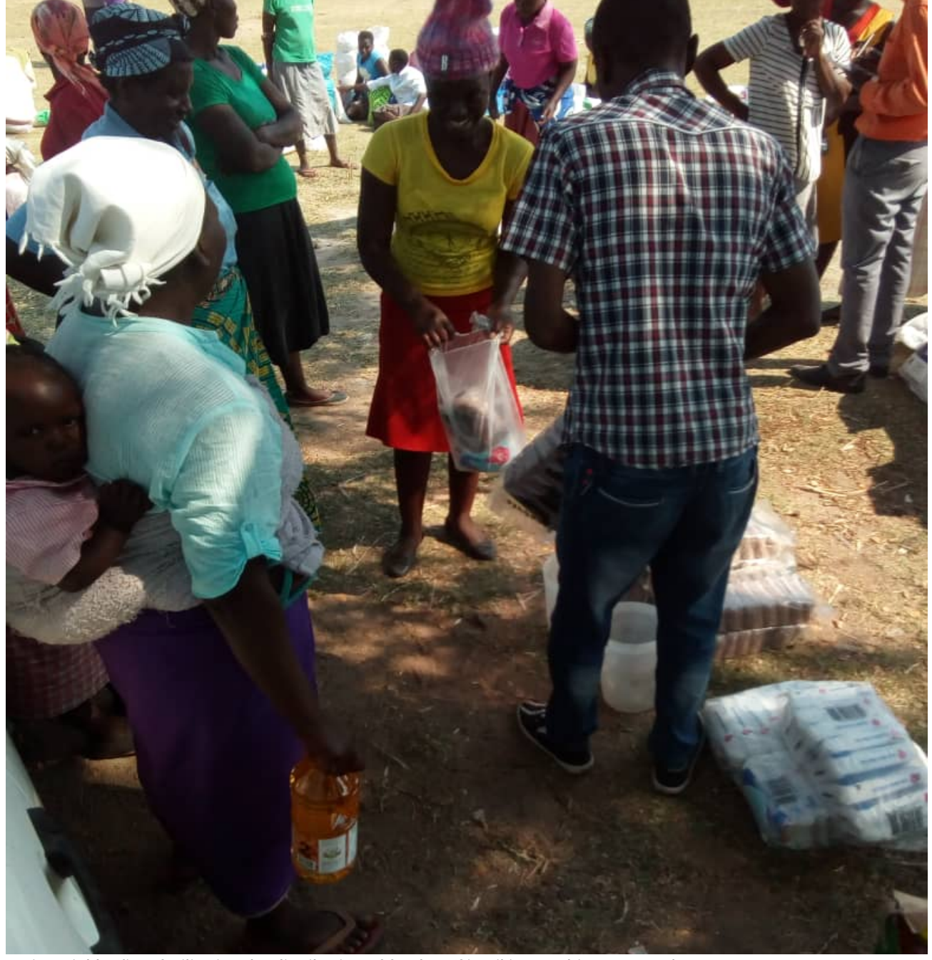
Caritas Field officer facilitating the distribution of food stuff in Bikita at Chirorwe ward 20