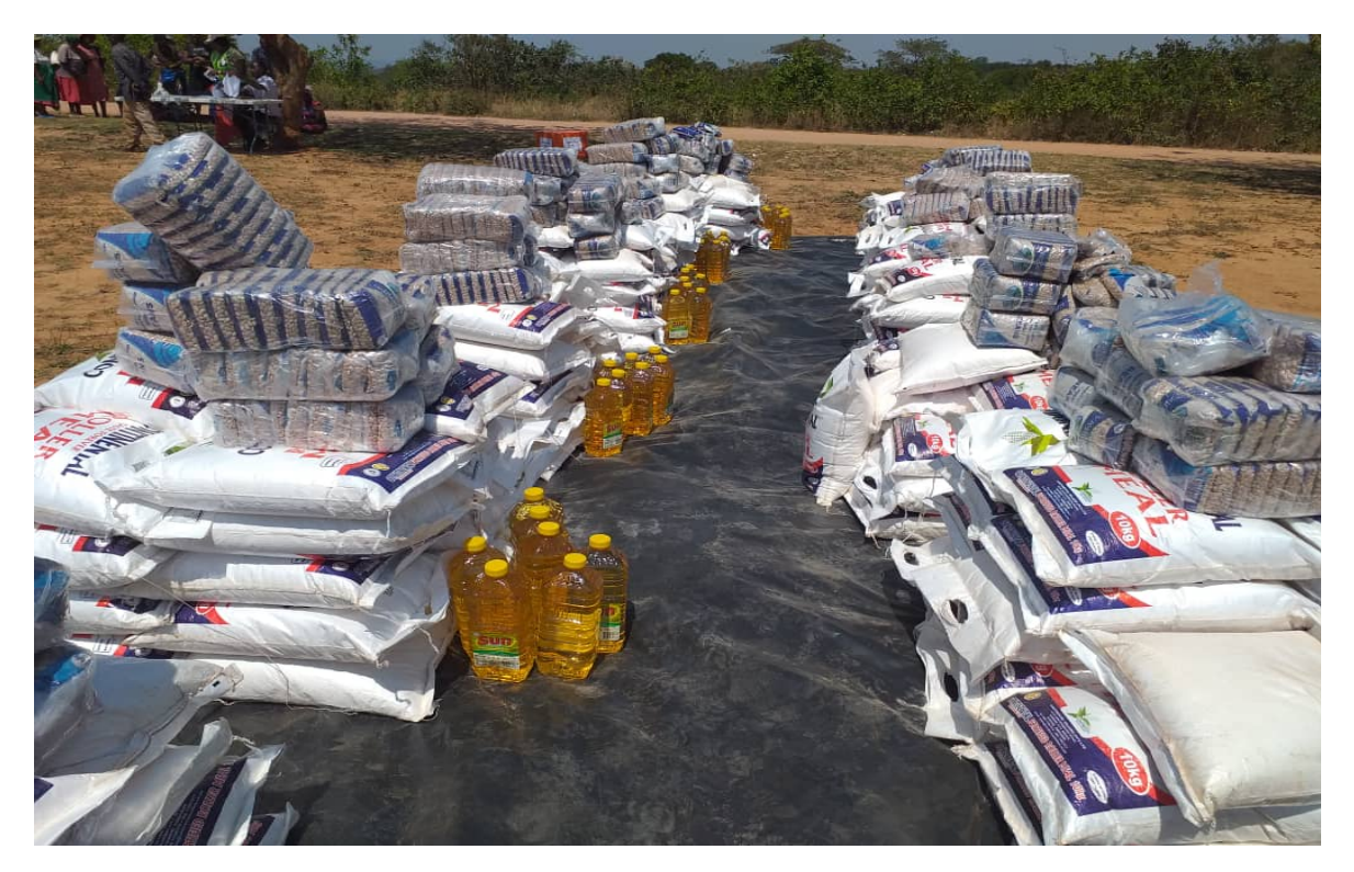
Food distribution in Chipinge ward 15 Muzite. 81households reached.429beneficiaries received food aid 204 males 225females.