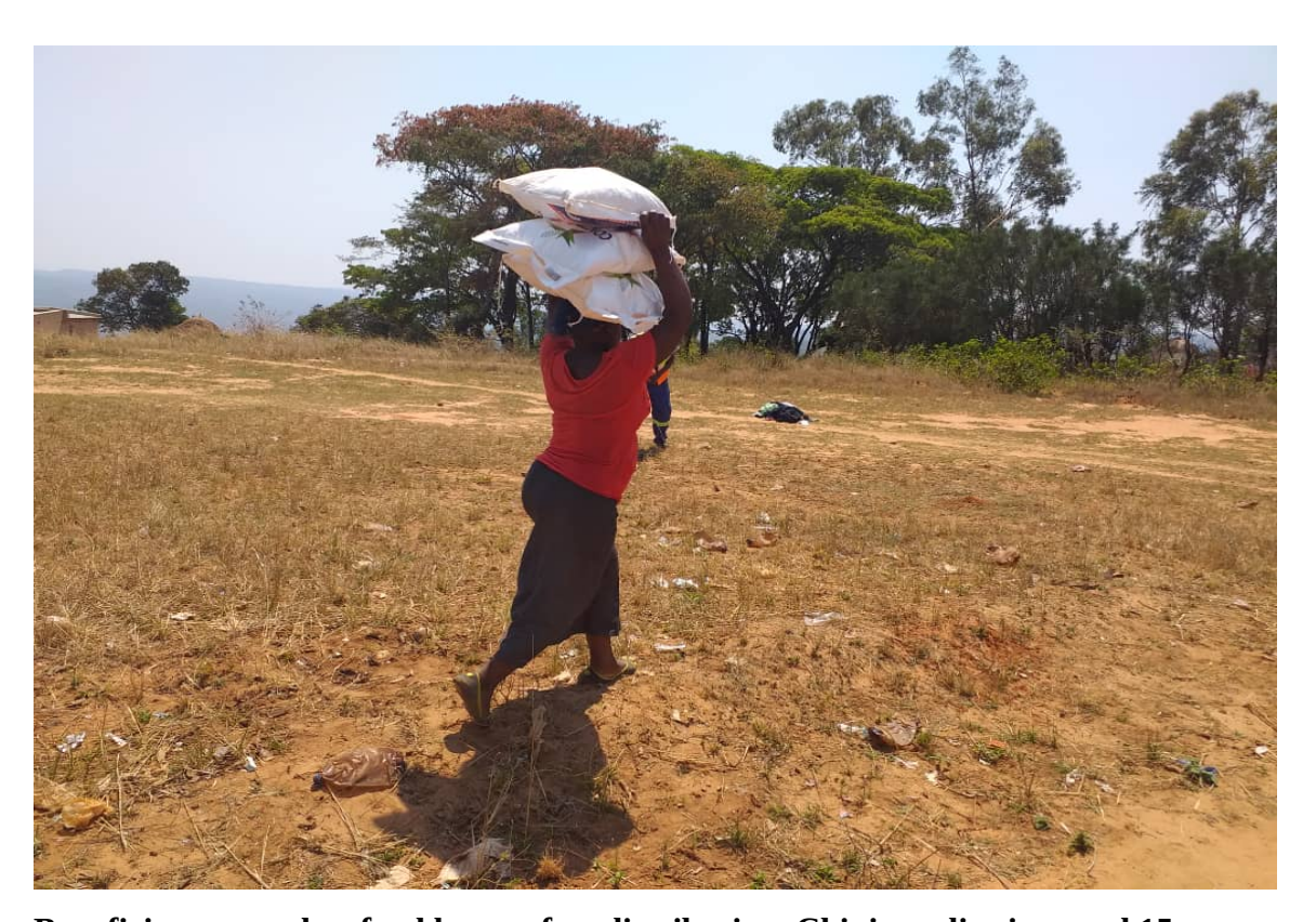
Beneficiary carry her food home after distribution. Chipinge district ward 15