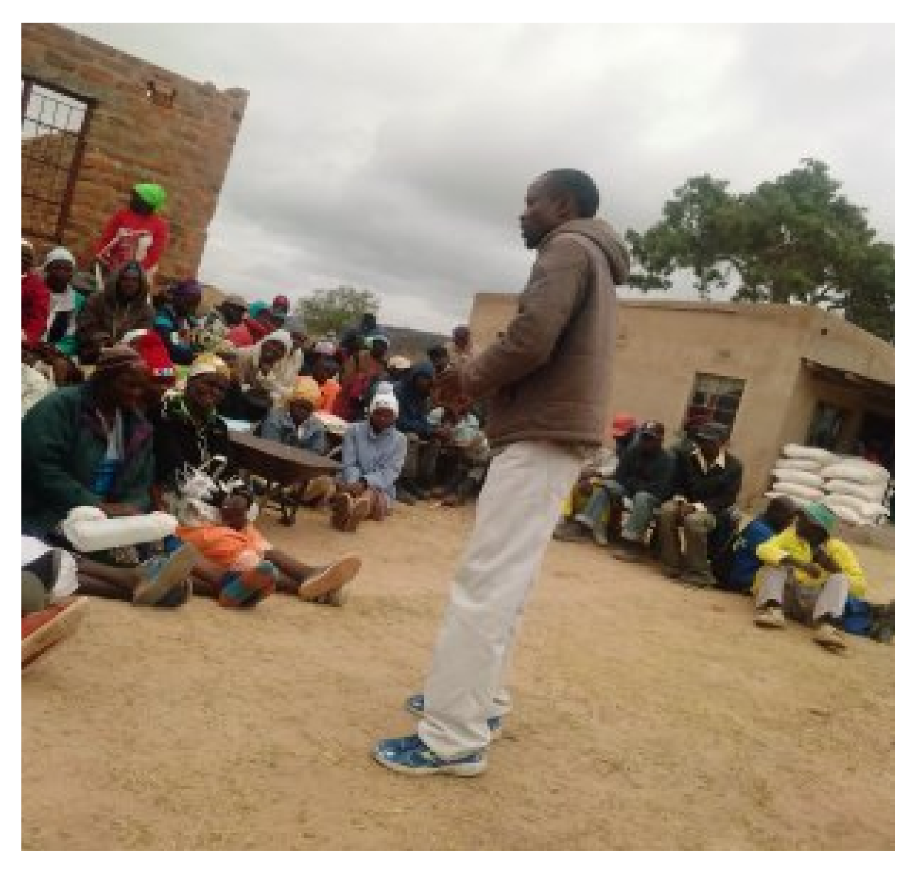
Caritas Field Officer explaining distribution procedures at Ndarambi in Gutu ward 12 before Distribution.