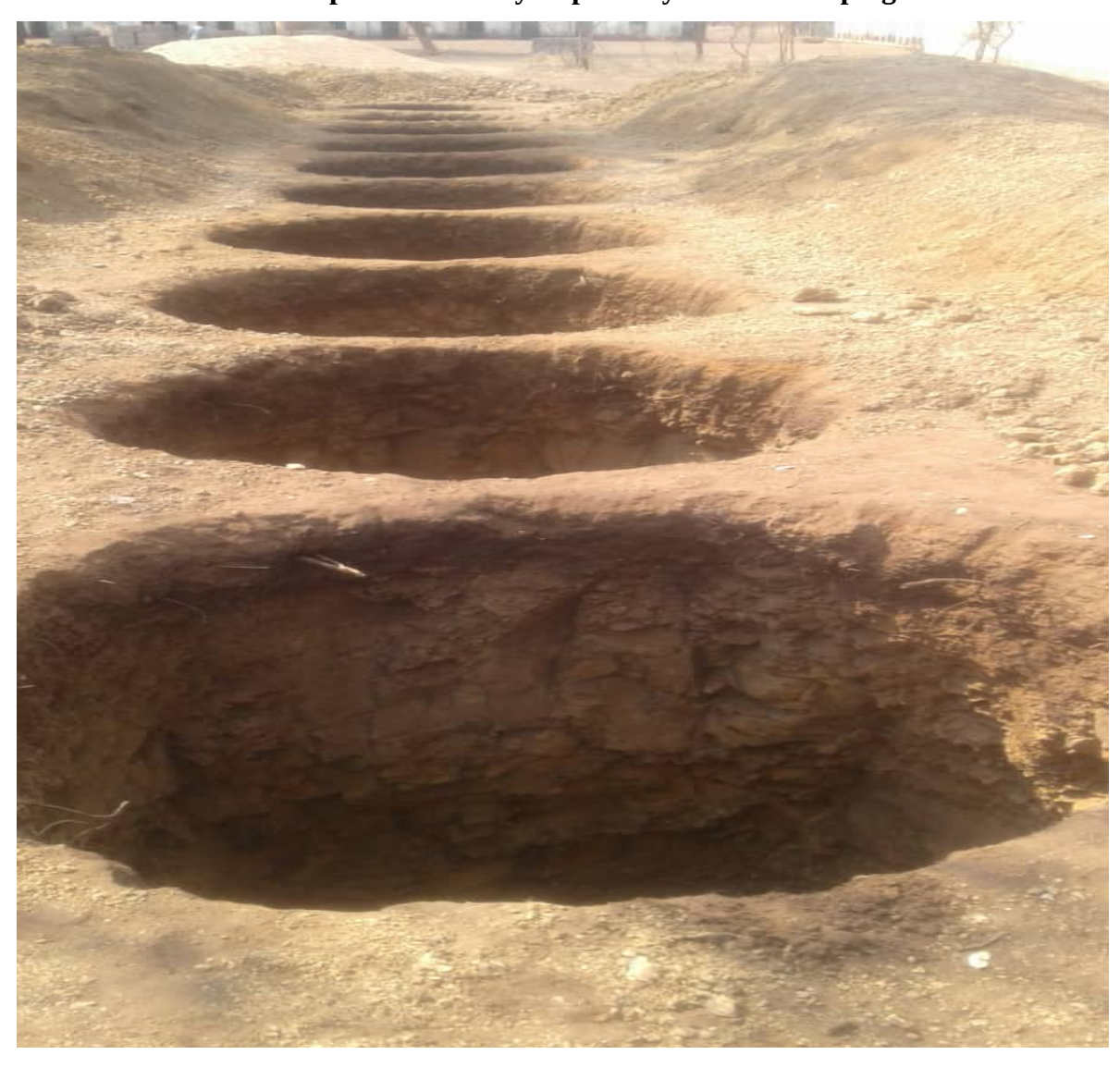
Excavation completed at Gotora primary in ward 22 Buhera Appendix