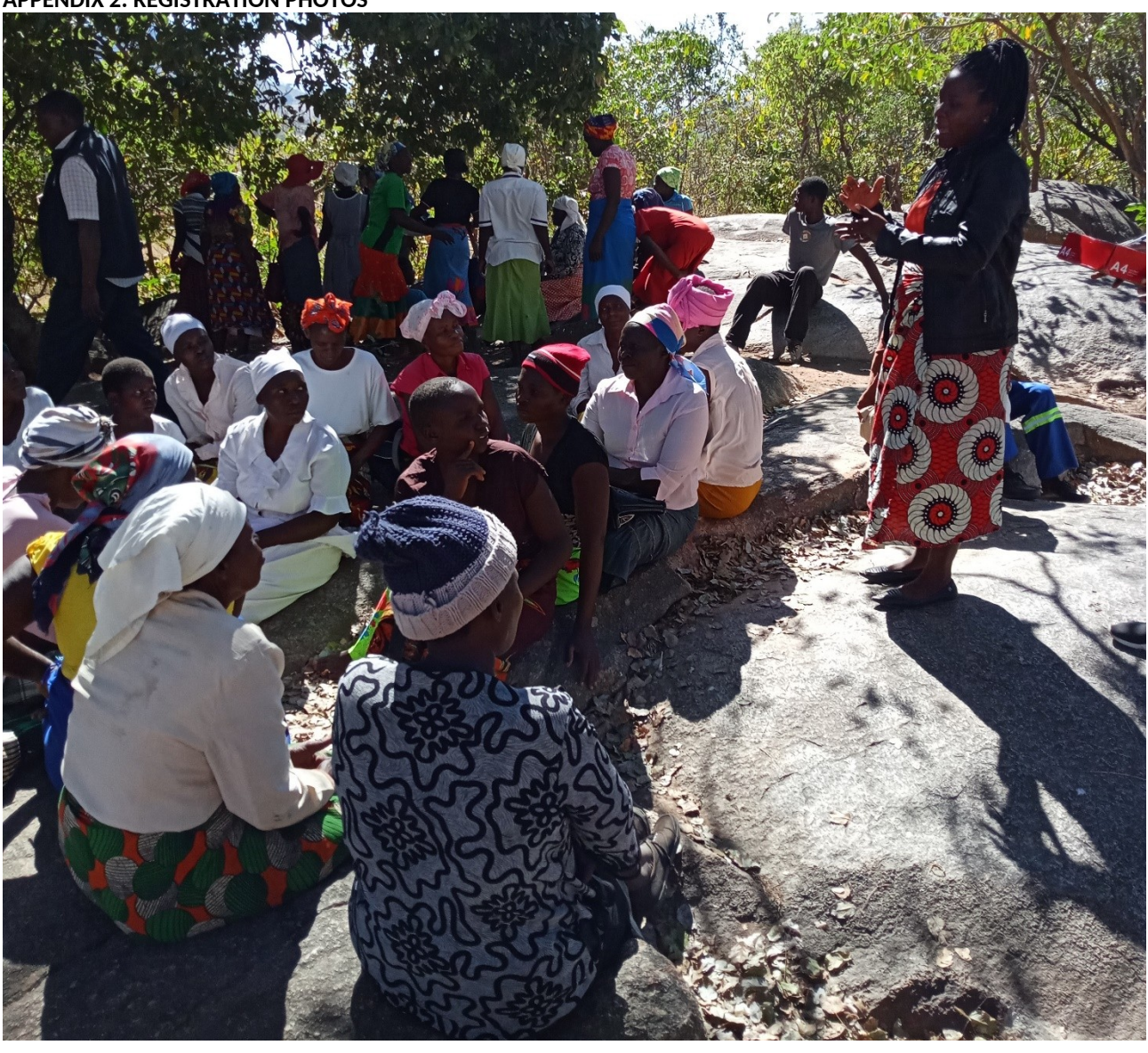
Caritas Staff conducting public address before registration in Bikita ward 7 at Chipendeke