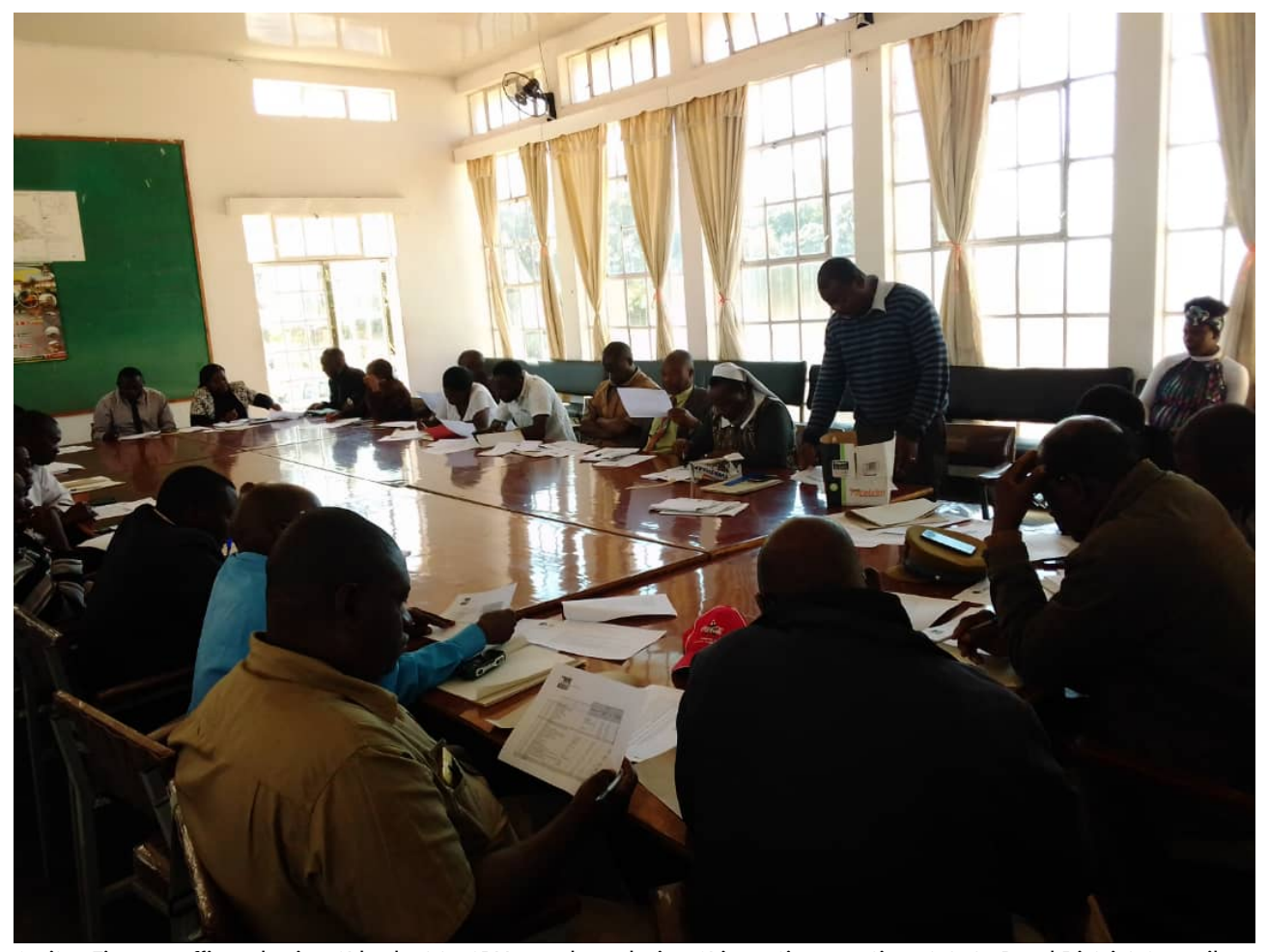
Caritas Finance officer sharing CI budget to CPU members during CI inception meeting at Gutu Rural District Council