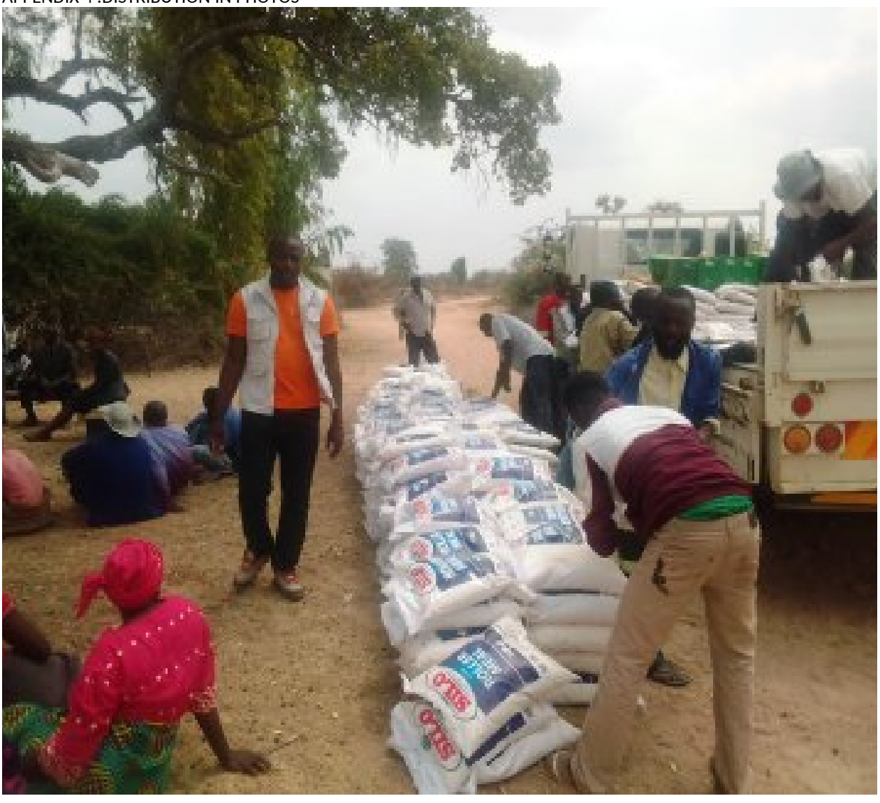
APPENDIX 4: DISTRIBUTION IN PHOTOS

Caritas Field OfFicer monitoring food stuff being offloaded at Makari ward centre in ward 15 of Gutu district