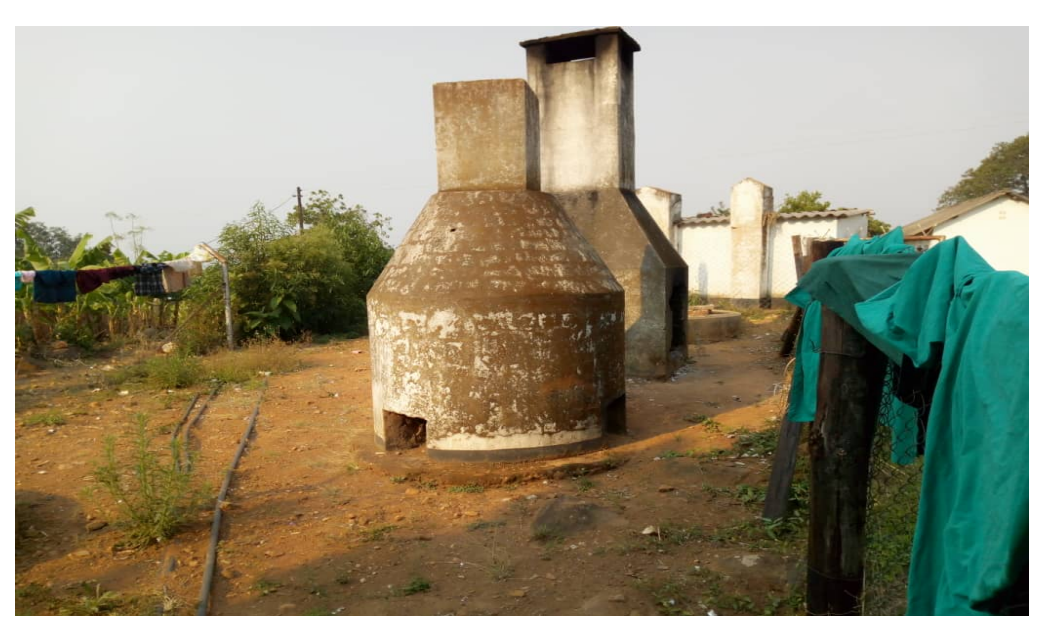
Assessments of waste zone at Mutsvangwa clinic Chimanimani in ward 23 The solid waste management site was selected for rehabilitation.