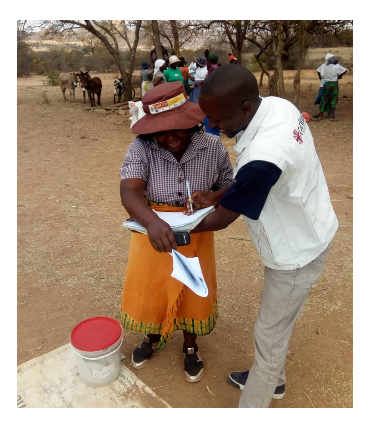
Caritas explaining the signing procedure to a beneficiary before receiving food hamper at Vanyoro ward centre in Zaka ward 23