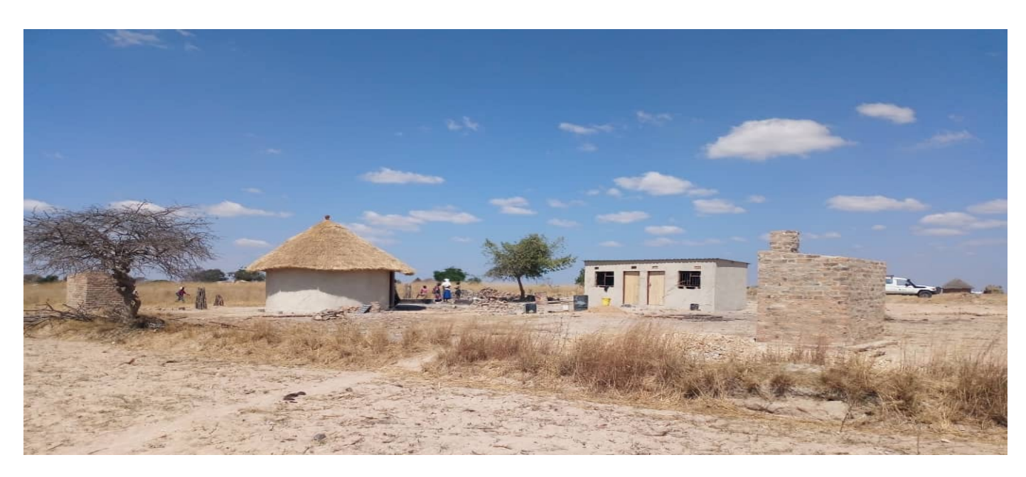
Mr and Mrs Evans Paradza Unyai's homestead completed. The model house has the full shelter package consisting of a two roomed flat house, round hut kitchen, latrine and protected deep well (pictured below).