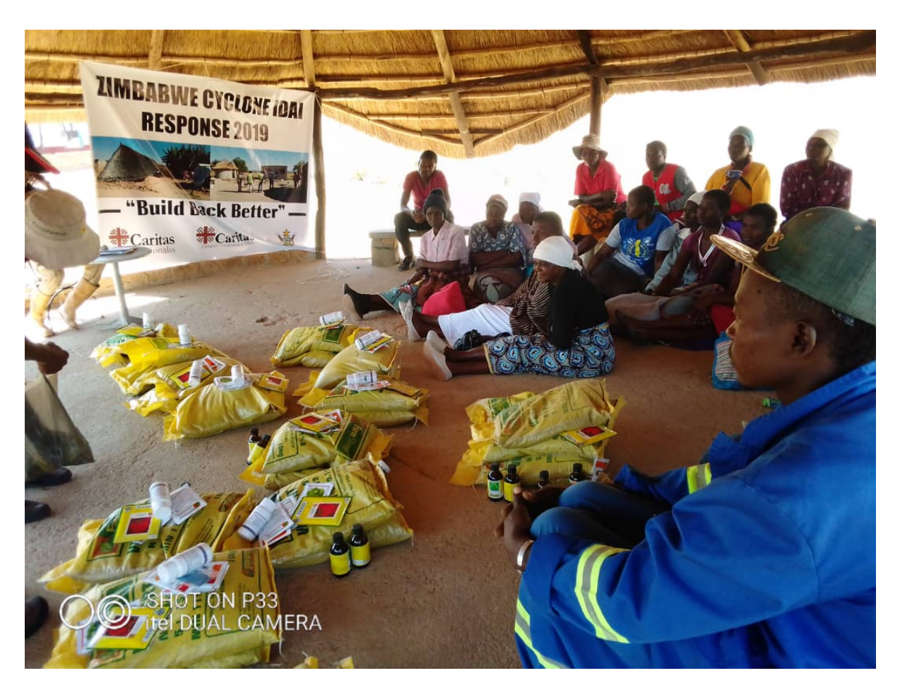
Distribution of livelihoods inputs for gardens in ward 16 (Nharira).